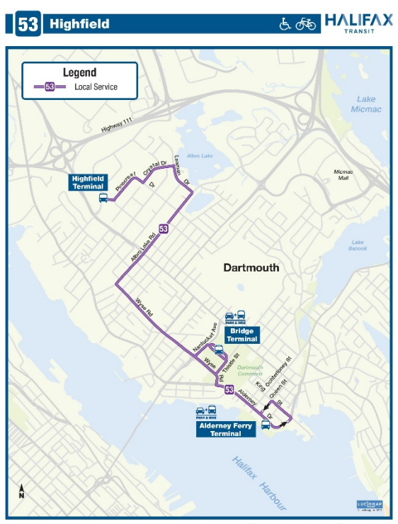
Effective Date: November 22, 202