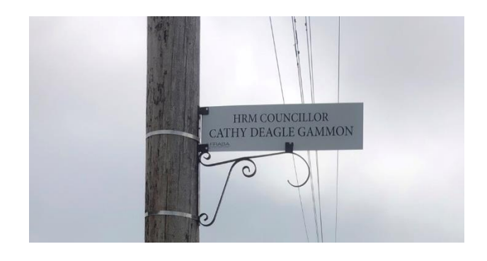
Sign is up!!!! Thanks, FRABA