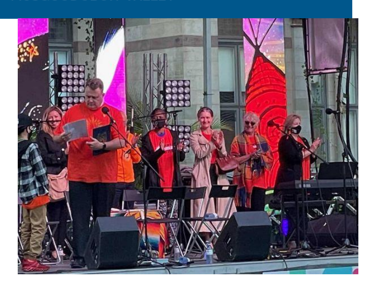
Flag Raising for Truth and Reconciliation!