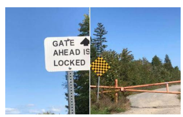
Finally, the Gate at Perrin Drive is locked, and we are thankful for all who made that happen!