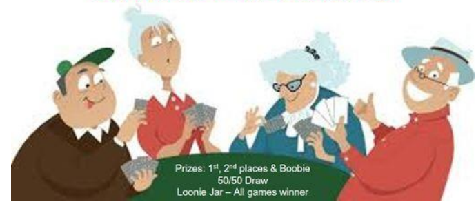
FRIDAY, OCTOBER 8, 2021 AT 7 PM – 10 PM Cards evening Meaghers Grant community hall

Auction 45 card games $5 per person **COVID 19 updates