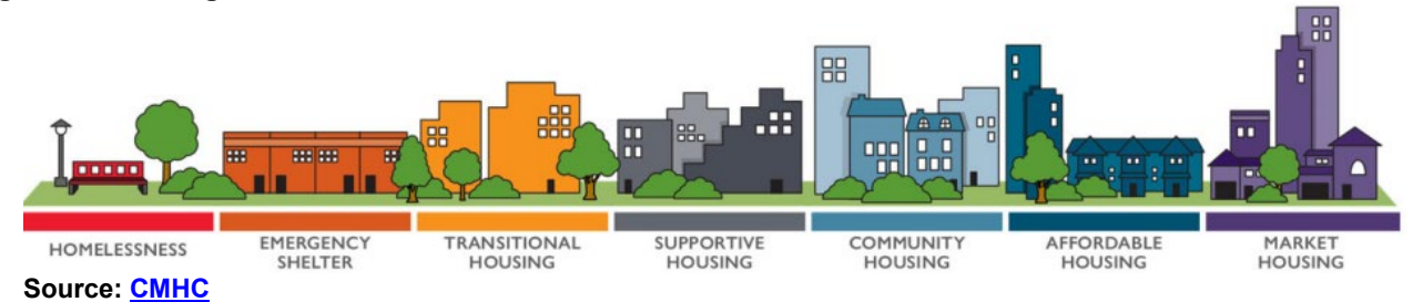
Figure 1: Housing Continuum

lower income households who have been displaced to more distant areas to obtain lower cost housing.<sup>5</sup> Additionally, offering better-located affordable housing can help alleviate the patterns and consequences of social-spatial exclusion, which adversely affect lower income and disadvantaged households.<sup>6</sup> An effective housing system can therefore address more than simply the need for affordable housing – it can directly address the health and well-being of individuals, their communities, and the economy.