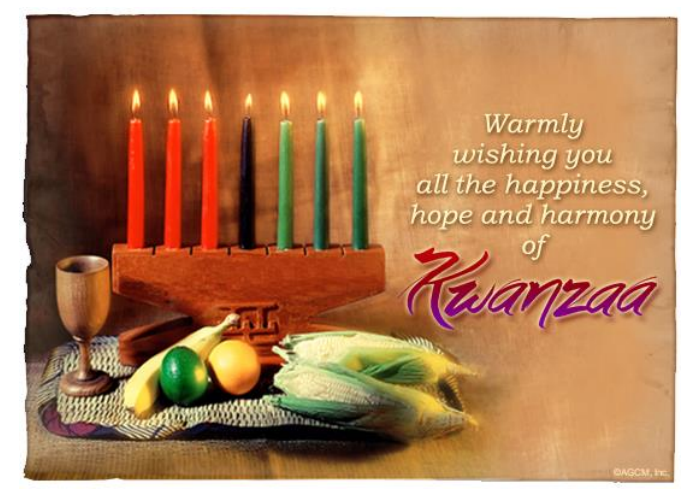
Kwanzaa is a cultural holiday that celebrates the African community, family and values and is celebrated from December 26<sup>th</sup> to January 1<sup>st</sup>.