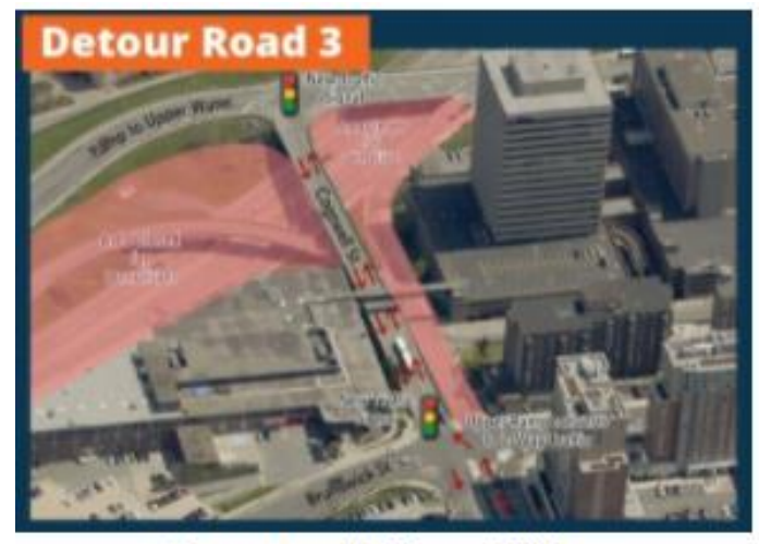
Bypass road 3; from Halifax

Staff have presented three by-pass routes that will enable commuters to drive through the <u>Cogswell</u> <u>redevelopment</u> area while avoiding the construction zone. The by-pass routes will be in use starting in spring 2022.