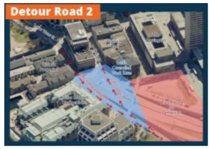
Bypass road 2: from Halifax