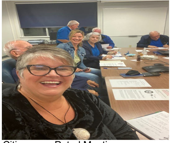
Citizens on Patrol Meeting