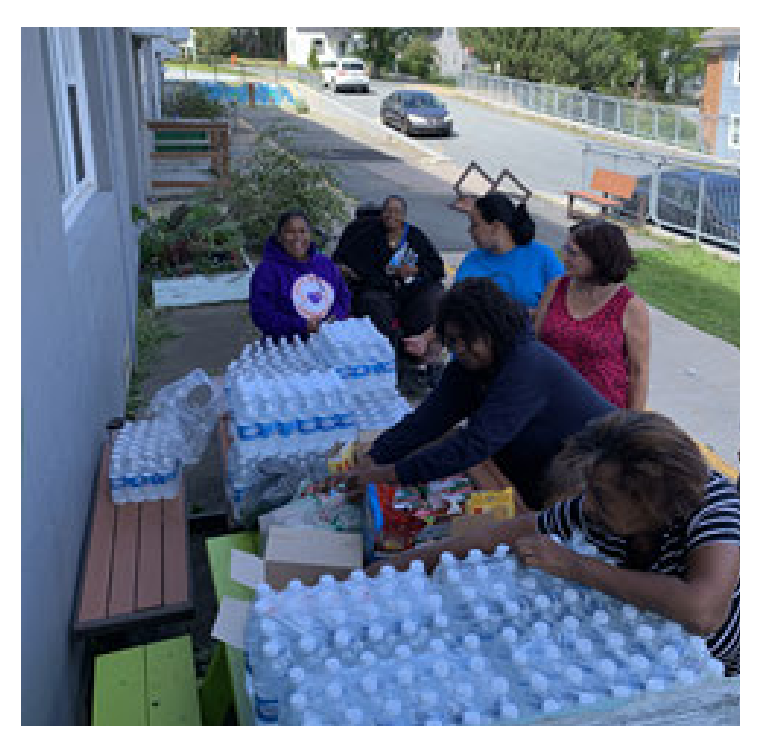
CMT members in Mulgrave Park handing out food in community after Hurricane Dorian