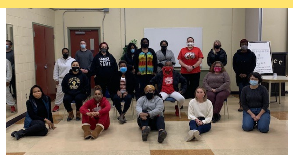
CMT at mental health first aid training in North Preston

Outcomes: In the evaluations, many people wrote that they chose to attend the training to become educated on how to help family and friends who struggle with mental illness. Others wrote they wanted to gain an understanding of mental health to educate their community and end the stigma surrounding these subjects. Participants also received a certificate in Mental Health First Aid.