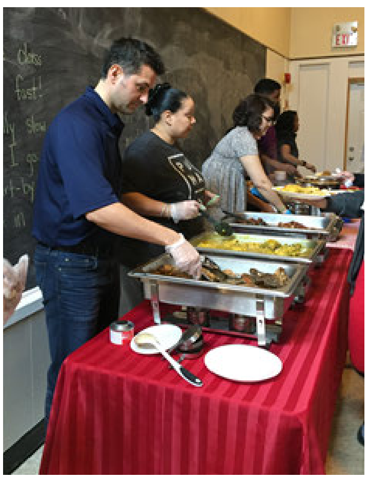
CMT members in Mulgrave Park handing out food in community at a celebration of life event.