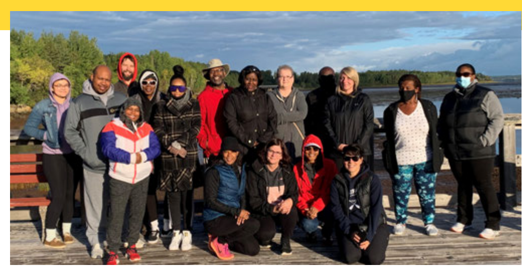
Working Cross Culturally Retreat in Tatamagouche

Community Mobilizations Teams (CMTs) in HRM have been active since 2017, stemming from community recommendations within the 2016 Mayors Round Table on Violence. The first CMT was established in Mulgrave Park and has grown to include the communities of Central North Halifax, and North and East Preston. Public Safety Office staff realize that each community operates in different ways and that relationships are unique and take time to build trust. CMTs build on community strengths to develop and implement practical solutions that increase safety and empower residents and community-based organizations. An essential step in establishing an effective crisis response is ensuring the community has the necessary capacity to support itself.