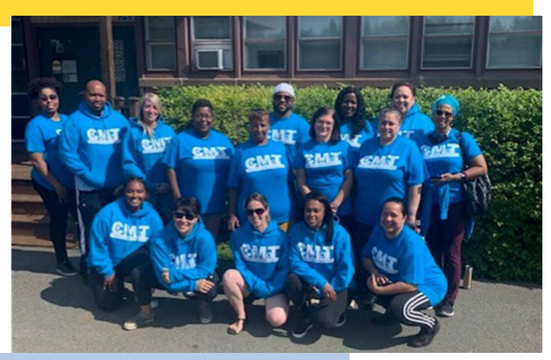
ASIST Participants at Tatamagouche Centre

Outcomes: Participants are trained in ASIST. Members were able to bond through story sharing.