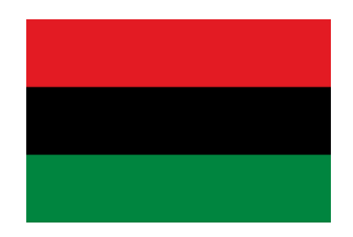
Figure 2: Pan-African Flag

The proposed artwork leverages existing Rainbow Crosswalk design but with colour variation. The design (Attachment 1) consists of a sequence of red, black, green, and yellow to make a block of four colours rather than the six in the original rainbow crosswalk pattern. The group views the installation of the Pan African crosswalk art as a focal point in celebrating and telling the story of the area as a historic African Nova Scotian community.