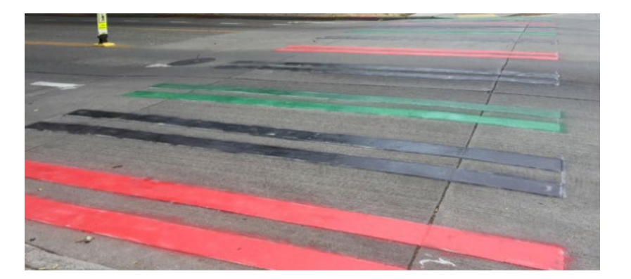
Figure 3: Pan-African Crosswalk, Seattle Central District

honour the history of the community. In addition, the city also began looking into developing a process that would enable communities to request the non-standard crosswalk design.<sup>6</sup>