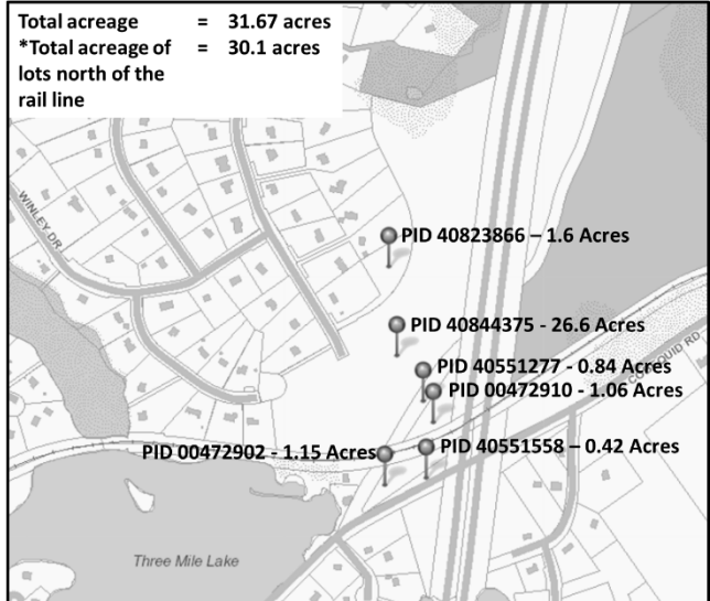
Figure 2: Map RL-3 of the Planning Districts 14 & 17 (Shubenacadie Lakes) Municipal Planning Strategy: Alternative Housing Opportunity Sites