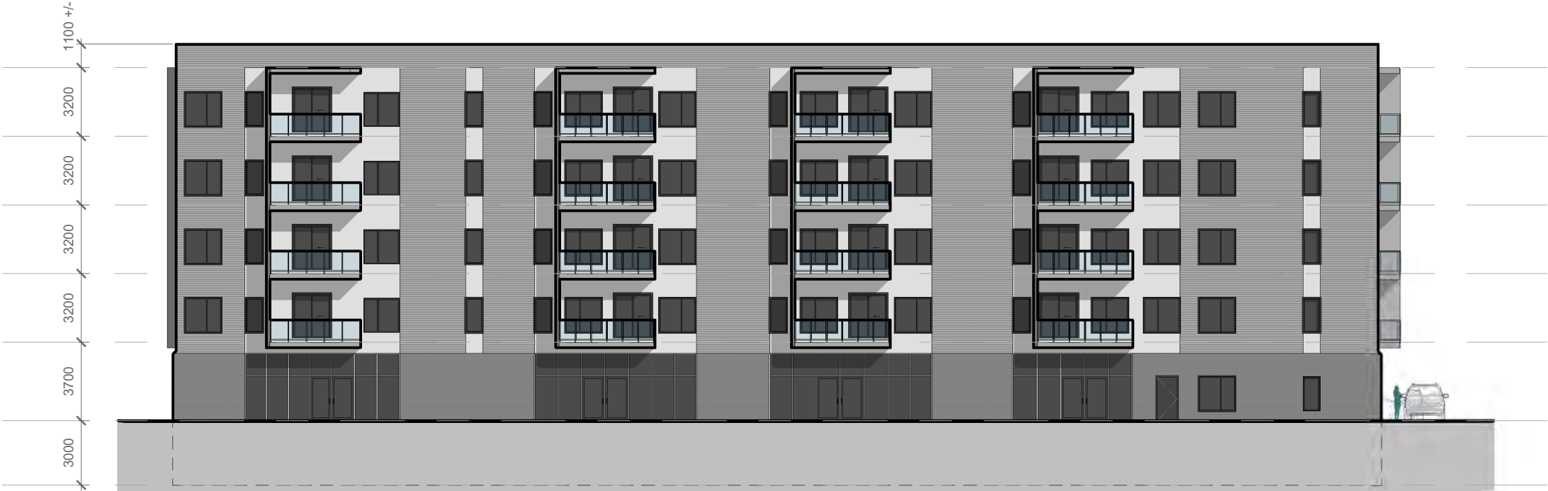
PLEASANT ST ELEVATION

Primary external buildings materials will be a mix of siding of various dimensions, direction and colour above the first level and a robust masonry type at the ground floor. Exact colours, texture and ratios of all elements shown are for inspiration only and may vary depending on availability and cost at the time of permitting. The overall building height may decrease following a possible reduction of floor-to-floor heights.