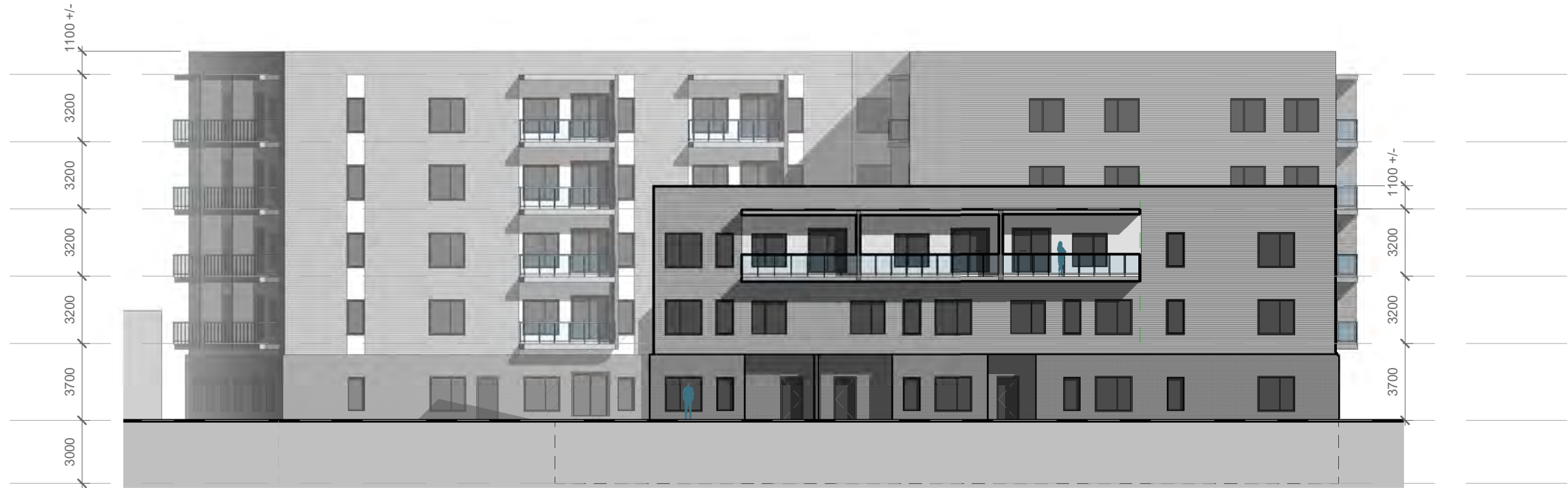
MACKENZIE ST ELEVATION