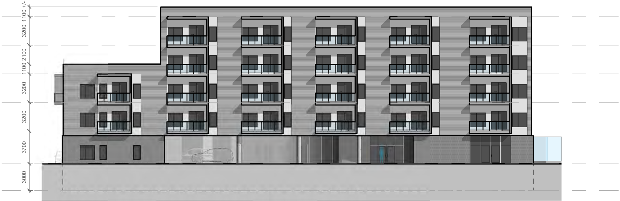
EVERETTE ST ELEVATION

Primary external buildings materials will be a mix of siding of various dimensions, direction and colour above the first level and a robust masonry type at the ground floor. Exact colours, texture and ratios of all elements shown are for inspiration only and may vary depending on availability and cost at the time of permitting. The overall building height may decrease following a possible reduction of floor-to-floor heights.