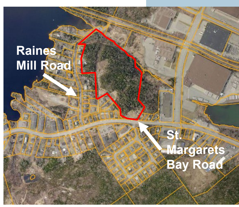
Property boundaries in red