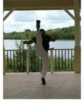
YOUTH & ADULTS MON & THU NIGHTS 6:30 TO 8:00