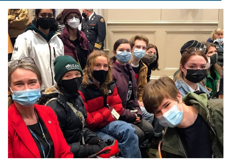
Youth advocates for HalifACT at City Hall to watch Budget approval.