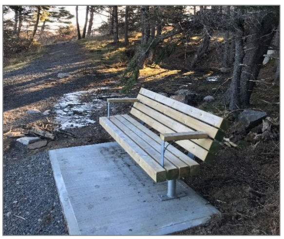
Bench repairs at Breaker's Park

Our summers have been extremely dry and the users of the park with charcoal barbecues were dumping hot coals into the water, into open spaces of the park or into garbage cans. This pilot will be monitored throughout the season and I am hopeful these containers will be used properly, and we will see more amenities like this throughout HRM. In the meantime, please picnic and barbeque responsibly.