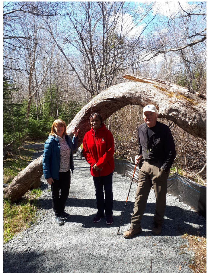
Picture: Blue Mountain Birch Cove Lakes trail - at the Brookline neighborhood in Bedford West.