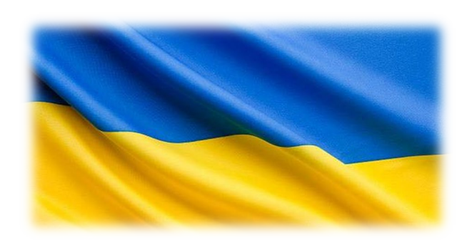
Grand Lake Community Centre 22 Lakeside Drive, Grand Lake Date: Saturday June 25, 2022

Dance, silent auction, 50/50, Bar, hot food, Door