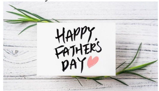
20 June 2022