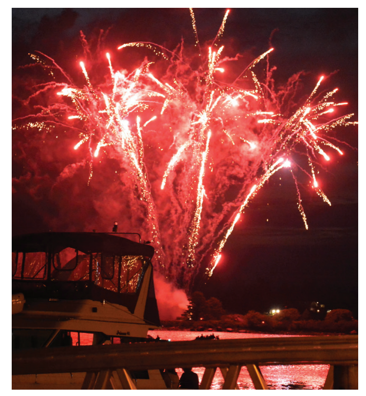
Fireworks are set off over Yarmouth's harbour during a previous Canada Day.

one of four classes of fireworks available for sale in Canada. Consumer fireworks are federally regulated under the Explosives Regulations, Part 16," reads a report that came before council. "The federal regulations do not provide limits on the use of the consumer fireworks that are sufficient to address the concerns of town council."