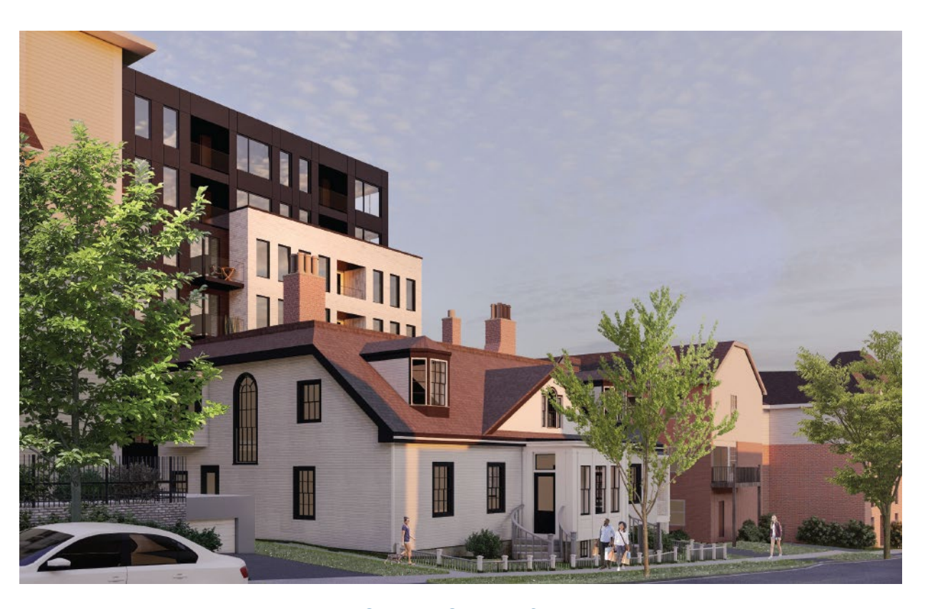
Pedestrian perspective on South Street facing southwest