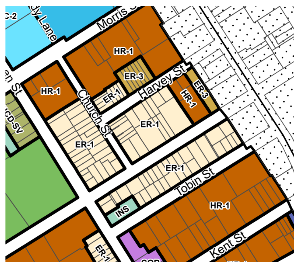
Regional Centre Land Use By-Law (Schedule 2)

Regional Centre Secondary Municipal Planning Strategy & Land Use By-law