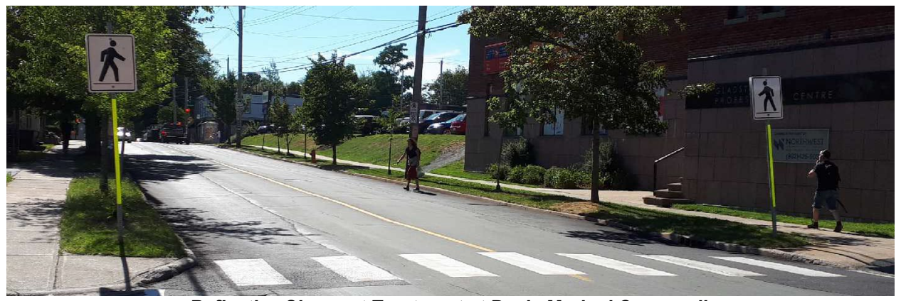
Reflective Signpost Treatment at Basic Marked Crosswalk

With the goal of improving the visibility of basic marked crosswalks (those with pavement markings and side mounted signs only) and make them more noticeable to drivers, staff undertook a project to apply reflective strips to the posts at these crosswalks. In total, fluorescent yellow/green reflective strips were applied to the posts at 353 crosswalks, beginning in 2018 and completed in 2019. Based on feedback received, the reflective strips have been very well received and provide a significant improvement to highlighting these crosswalk locations. Staff will continue with this treatment as part of typical installation for basic marked crosswalk installations.