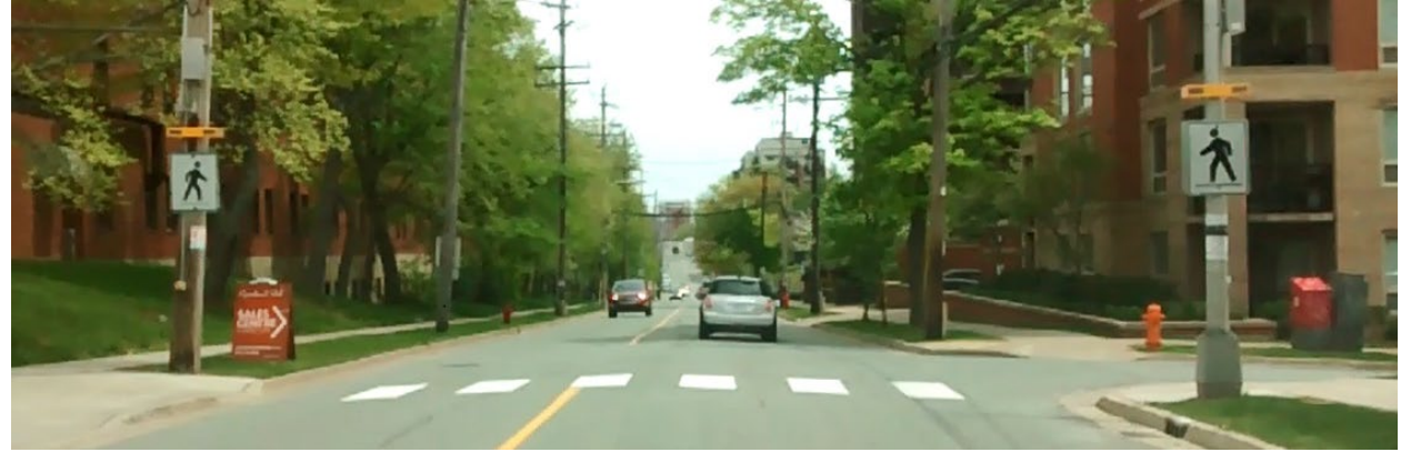
RRFB Enhanced Crosswalk

Staff has undertaken a review of all basic marked crosswalks (those with pavement markings and side mounted signs only) and identified locations where an upgrade to RRFB would be appropriate. The assessment resulted in 79 locations identified for upgrade with a further 36 locations where additional data would be required to make a final decision on whether the location would be appropriate for upgrade.