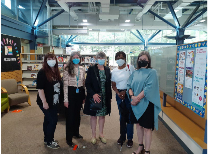
Meeting at Keshen Goodman Library to hear all the upcoming renovations such as: glass walls and sound reduction ceilings,

Welcome RH Fitness & Wellness to District 12! Located at 168 Hobsons Lake Drive, Suite 102.