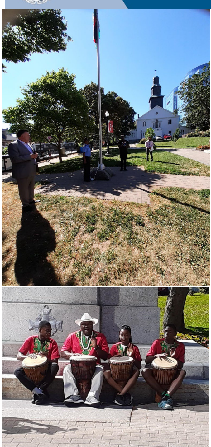
Emancipation Day, August 1st, 2022 - City Hall

TIMBERLEA - BEECHVILLE - CLAYTON PARK - WEDGEWOOD