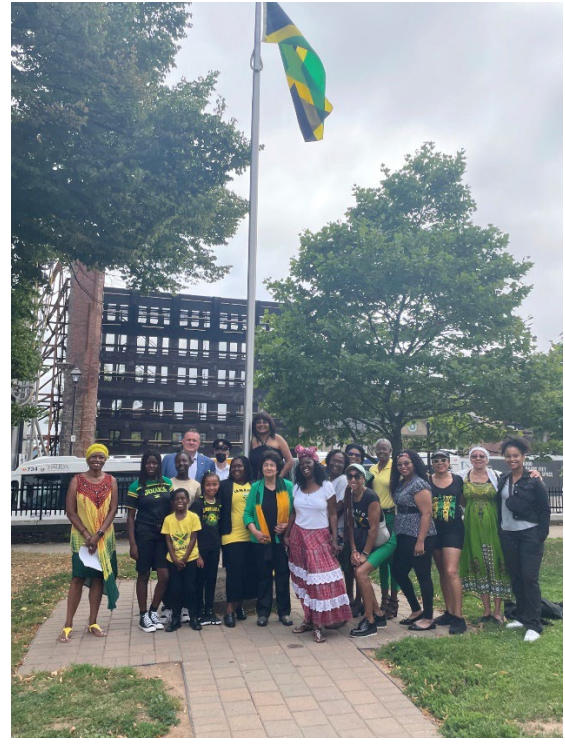
Jamaican Independence Celebration Flag Raising – August 6<sup>th</sup> at Grand Parade, City Hall