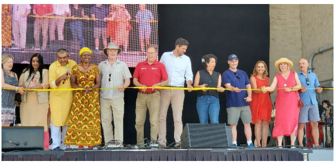
Ribbon cutting at Nova Multi-fest 2022 - Alderney Landing