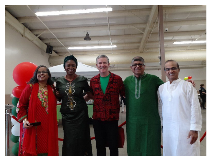
Bangladesh Festival '22 – August 6<sup>th</sup> – 7<sup>th</sup> at the Halifax Forum

excellent and well attended celebration at the Halifax Hotel in Clayton Park.