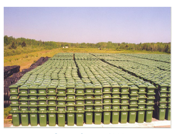
Green Carts - 1999