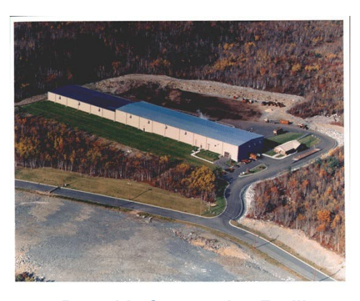
Burnside Composting Facility 80 Gloria McClusky Ave