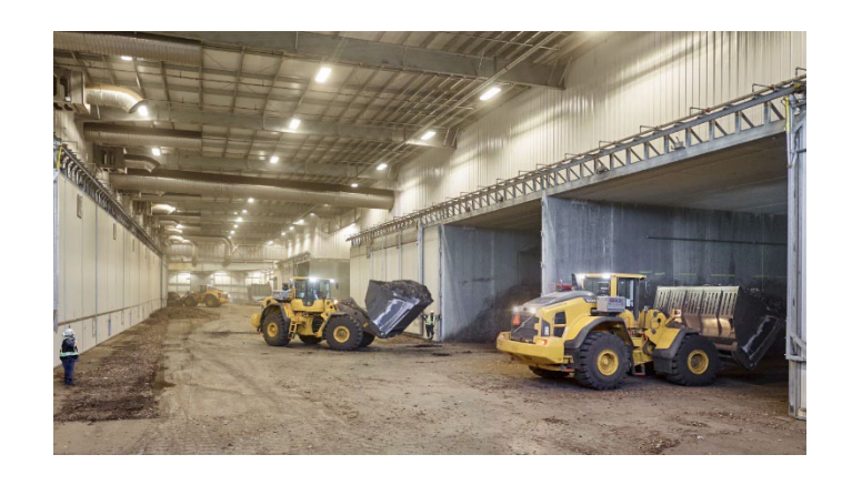
Calgary Composting Facility