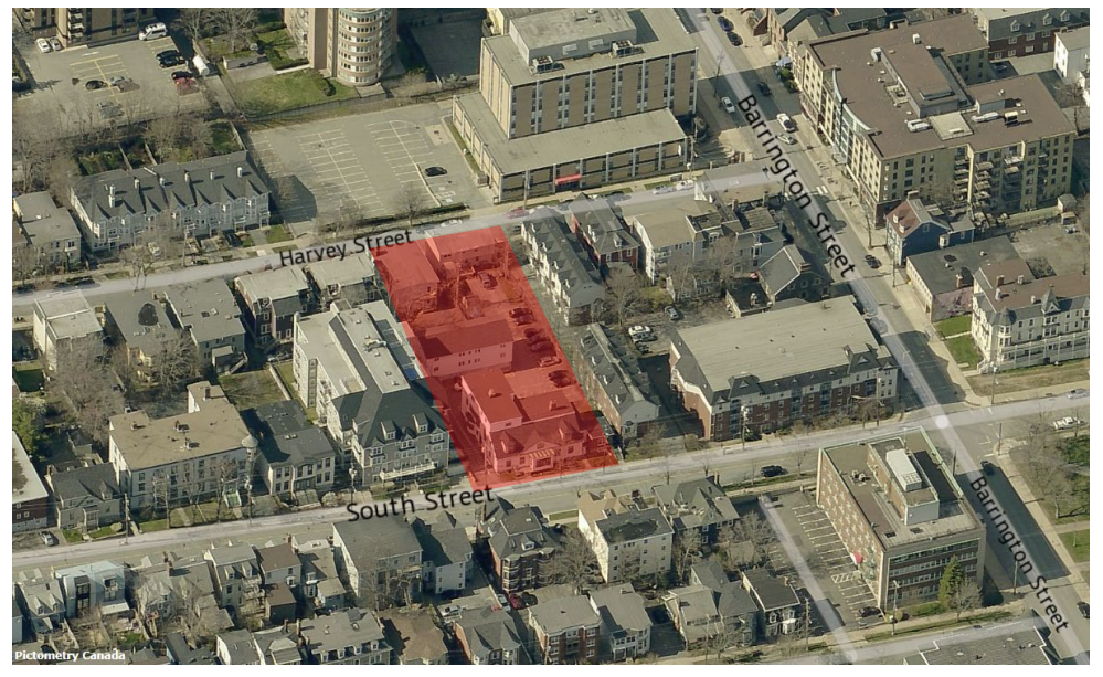
Subject site, facing north, registered heritage building faces South Street, and the site extends to Harvey Street