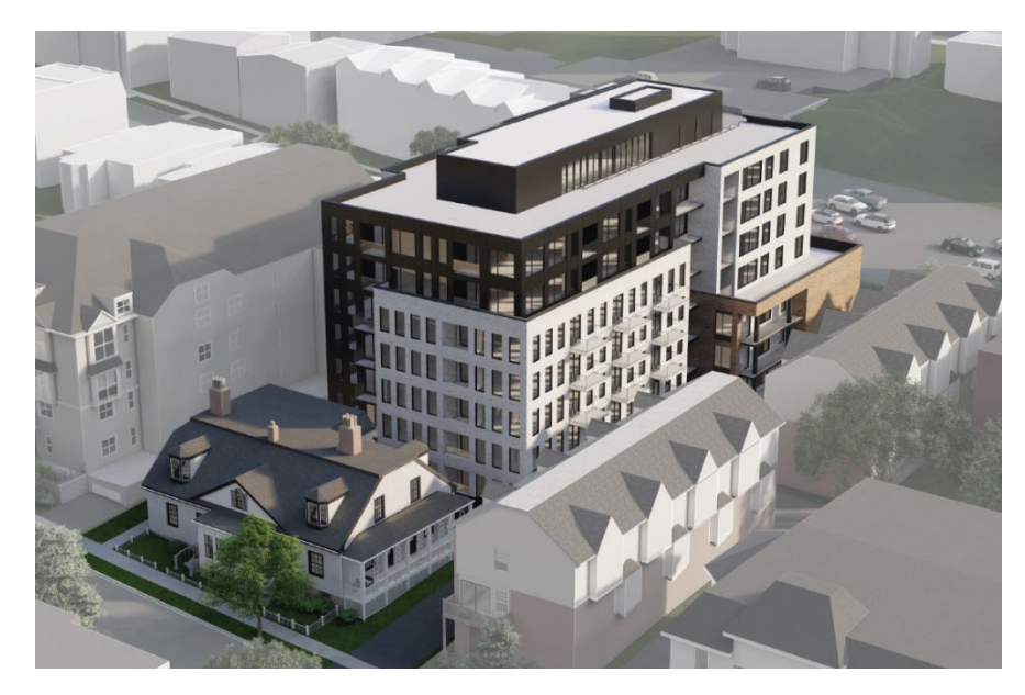
View of project with eight storey residential building, in the middle of the block, between Harvey and South Streets