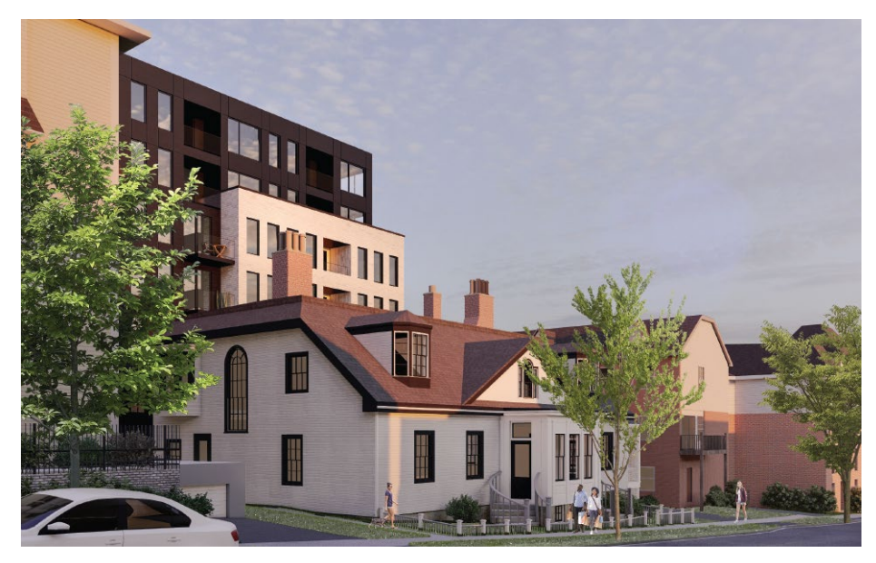
Pedestrian perspective on South Street