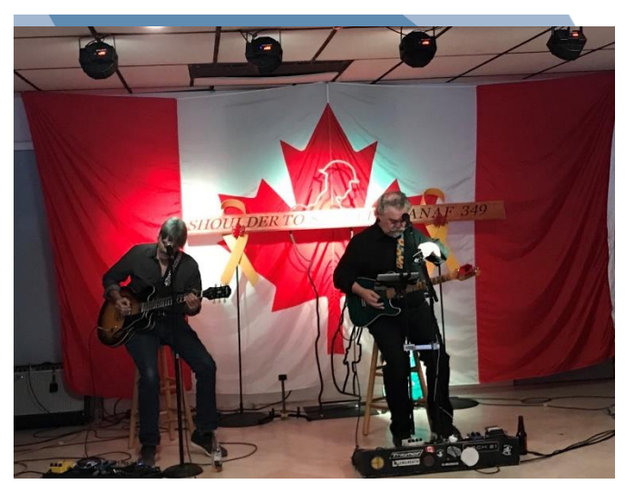
It is always special to visit the Army, Navy & Airforce Club on Remembrance Day

Come celebrate the many ways we give at the North Grove's Giving Tuesday Get Together on Tuesday, November 29<sup>th</sup> from 10:00 a.m. to 12:00 p.m. They will have good food, great company and some fun crafts to kick off the giving season. Thanks to their board and a group of dedicated supporters, every gift given starting November 29<sup>th</sup> will be matched up to $50,000 – doubling its impact in one of their most challenging years. Visit their website for more details.