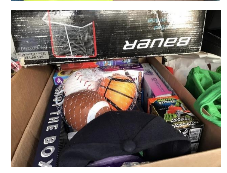
We also delivered 16 turkeys, warm sweaters and kids skates to Helping Hands: Families