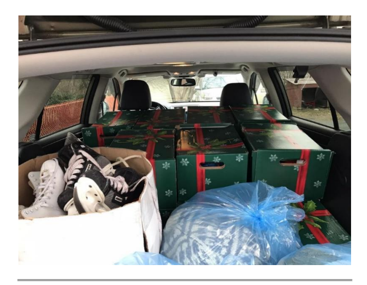
Christmas Express deliveries of fresh fruit/vegetables!

Helping Families Society in Chaswood. Many thanks to our anonymous community partner.