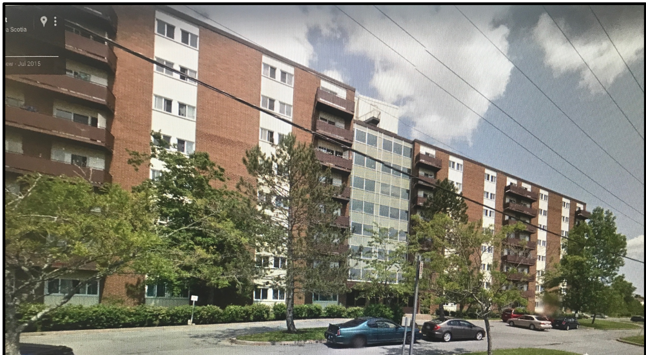
Figure 4 14 Churchill Court - located 250 meters from the Kuhn Block proposed project.

The three buildings contain an estimated 230 apartment units, 230 surface parking spaces and range in height from 3 to 8 stories. The paved surface parking is estimated to cover some 6,410 sm (69,000 sf) of land. The buildings front on to the Green Belt to the south and east but otherwise are adjacent to single family residential neighbourhoods.