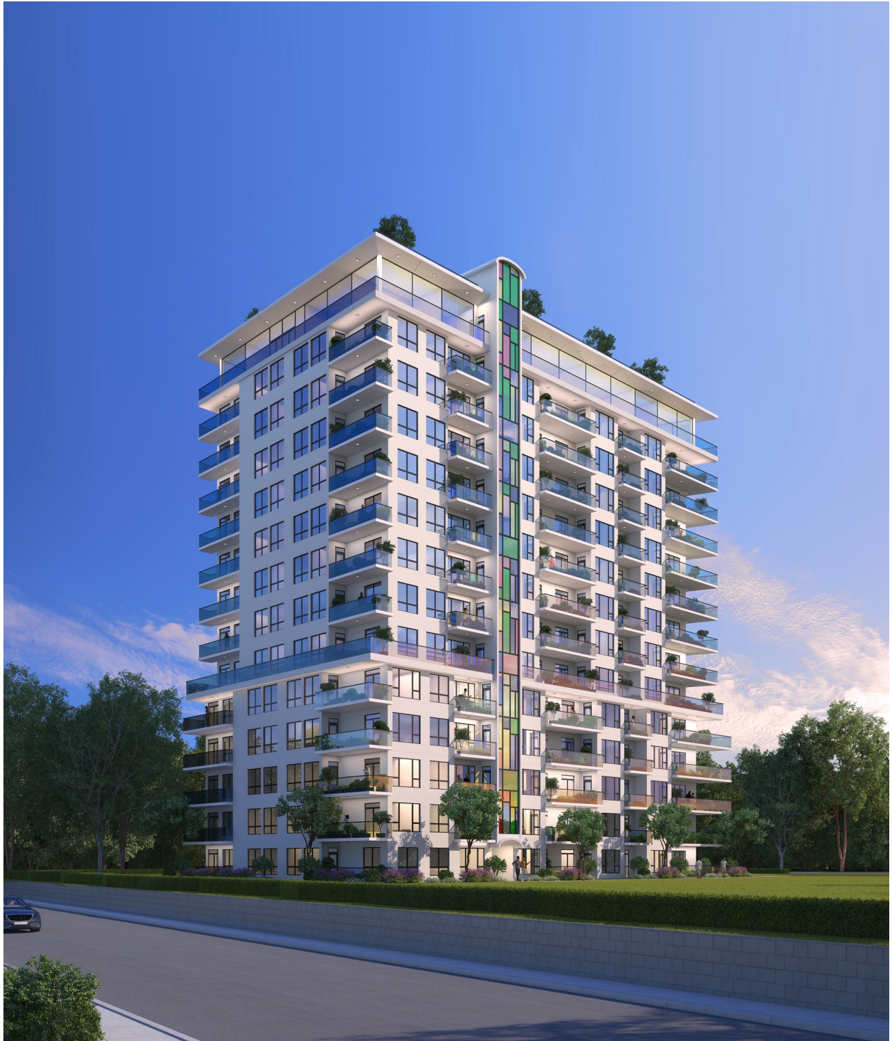
Figure 4 Proposed "Gardens on Main". View from Main Street looking west.