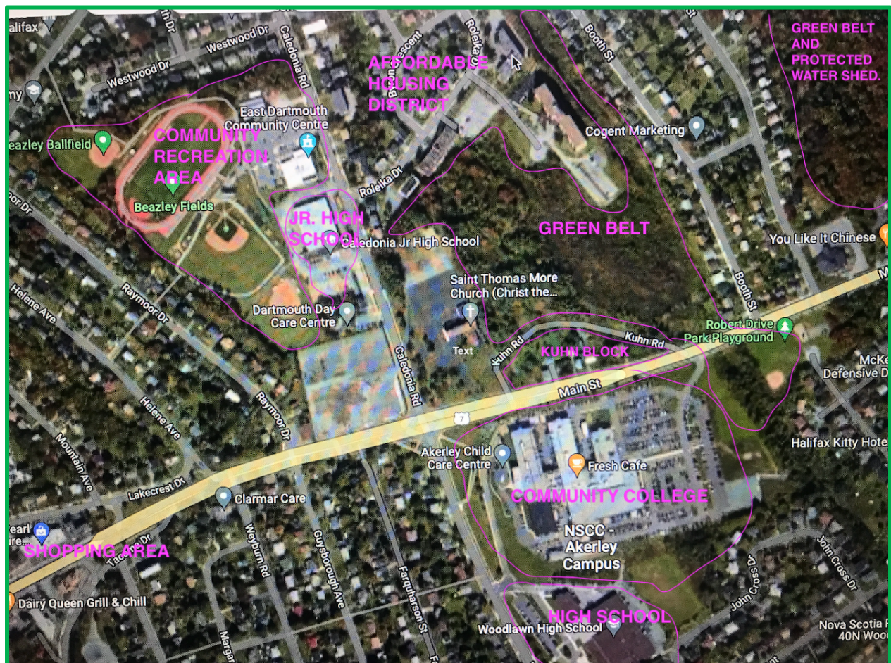
Figure 1 Aerial view of East Dartmouth at the corner of Caledonia and Main Streets.

The East Dartmouth Community is well served with recreational and educational facilities, shopping districts and transportation links. Within a 15-minute walk of the proposed project, located in the Khune Block, residents can access: