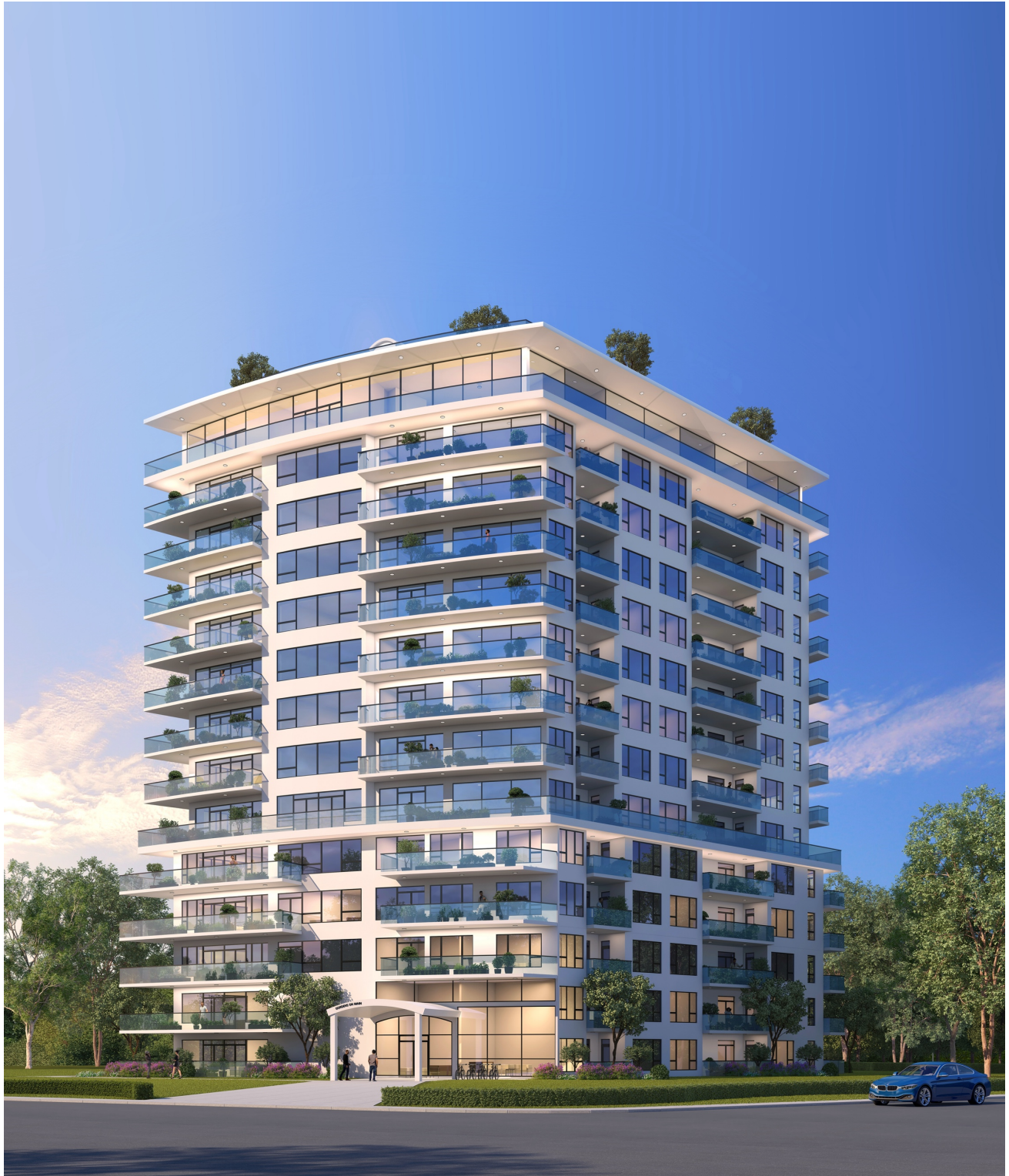
Figure 3 Proposed "Gardens on Main". View from the corner of Kuhn and Main Street.