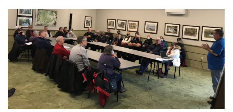
We had a great community meeting to discuss expanding Pickleball facilities in Dartmouth

This month our road safety team is promoting information about on Intersection Safety. Intersection Collisions are one of the seven emphasis areas in the Strategic Road Safety Framework, to focus resources to have the greatest impact on reducing fatal and injury collisions. We all have a shared responsibility in keeping our roads safe. Be mindful of other road users, avoid distractions and exercise caution when using our intersections. You can find more tips and information here.