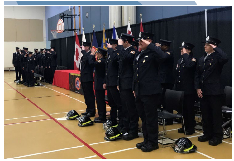
On December 16<sup>th</sup> we welcomed 20 new firefighters to Halifax Fire & Emergency.