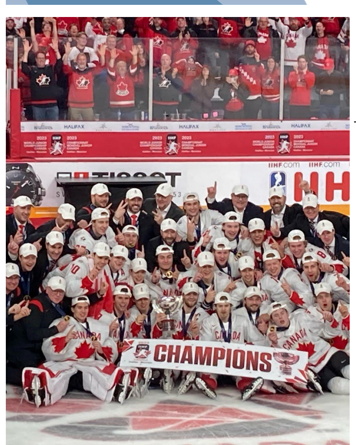
Congratulations Team Canada and all the people behind the scenes especially the many volunteers!