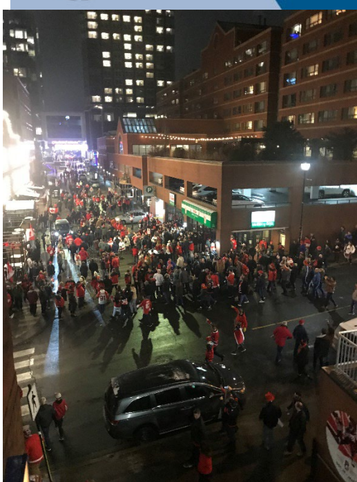
Downtown Halifax celebrations during the World Juniors!