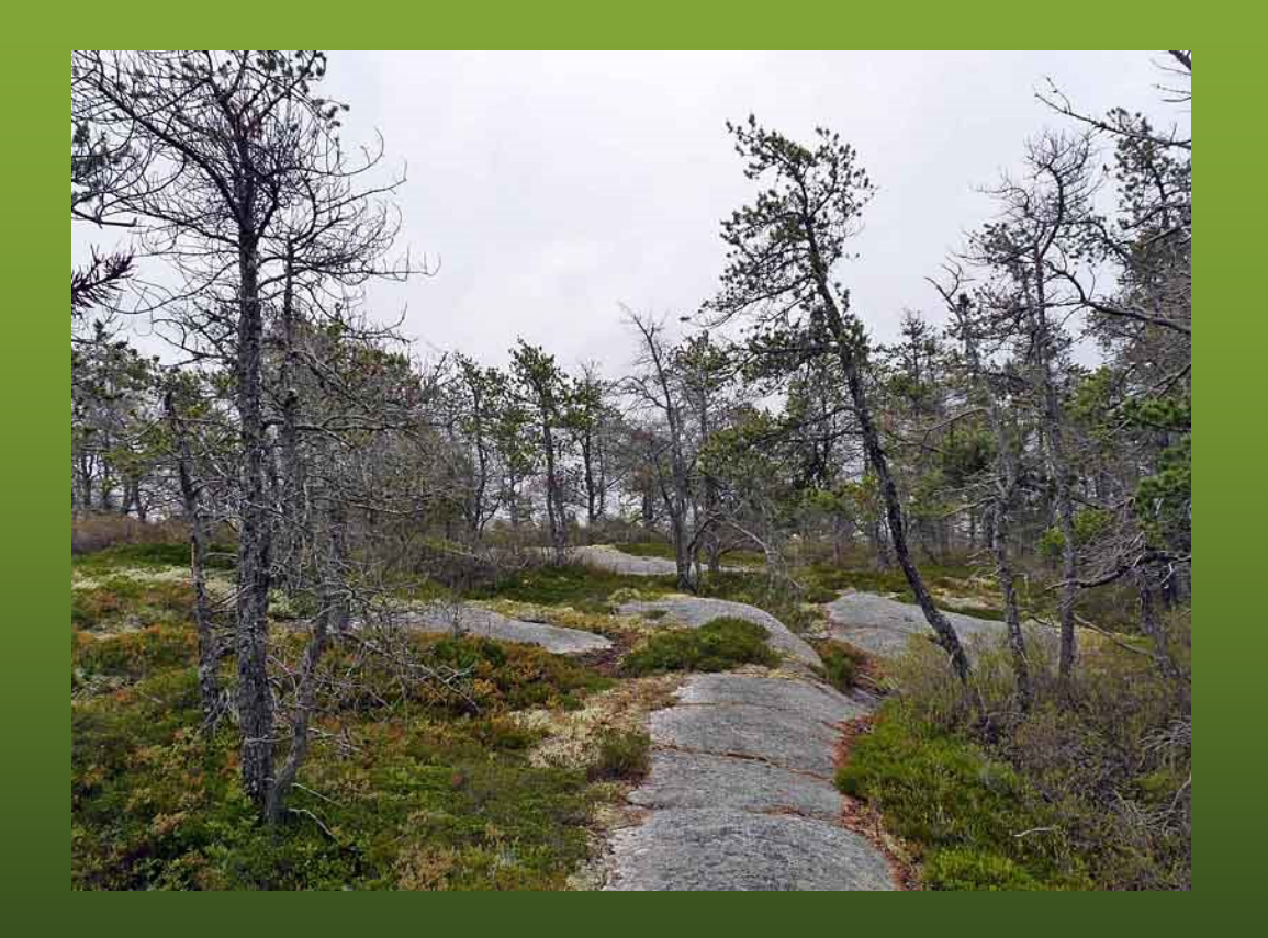
Not a place for housing development