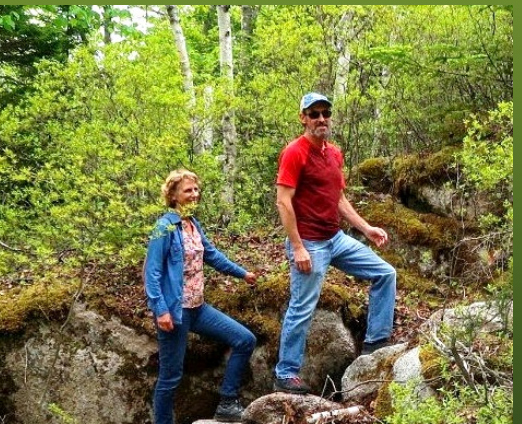
A cornerstone for the Halifax Green Network Plan