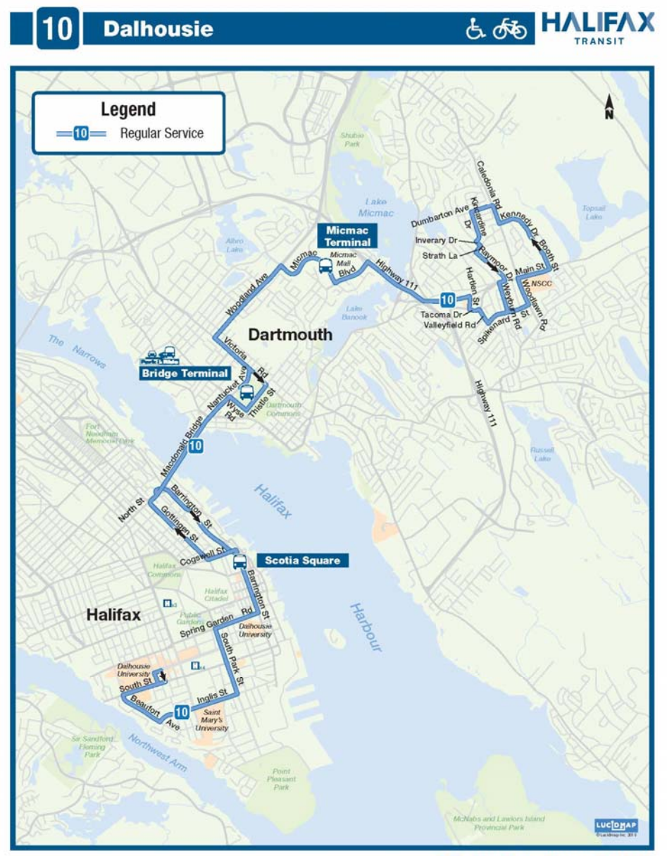
Exhibit 2.4 – Halifax Transit Route 10 Dalhousie

There are concrete sidewalks on both sides of Main Street near the proposed development. The Main Street/Caledonia Road/Woodlawn Road intersection to the west offers opportunities for pedestrians to safely cross Main Street and there is a marked crosswalk with overhead beacons on Main Street located approximately 320 meters east of Kuhn Road.