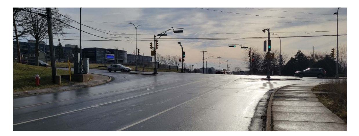
Caledonia Road at Main Street looking south