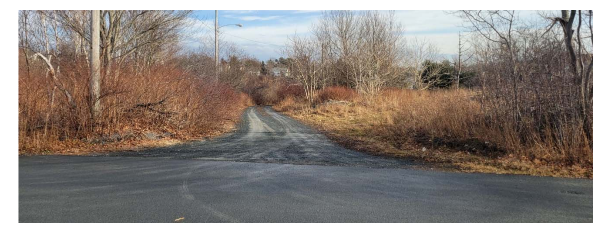
Kuhn Road looking east at Rear Entrance to Church