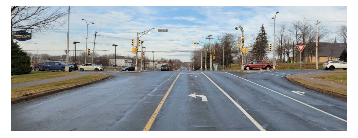
Woodlawn Road at Main Street looking north