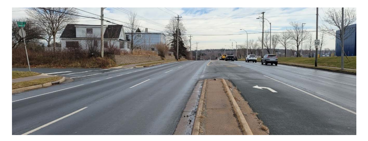
Eastbound Left Turn Auxiliary Lane on Main Street at Kuhn Road