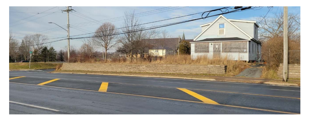
Exhibit 1.4 – 247 Main Street in Dartmouth, Nova Scotia

JRL consulting inc. was retained by the owner to prepare a Traffic Impact Statement (TIS) to assess the potential traffic impacts of the proposed residential apartment development in Dartmouth, Nova Scotia.