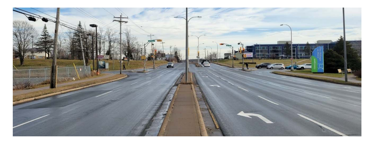
Main Street at Woodlawn Road/Caledonia Road looking east