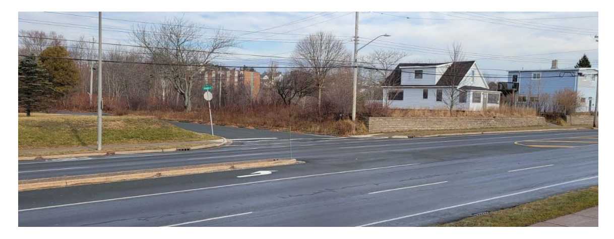
Exhibit 2.2 – Study Area Photos