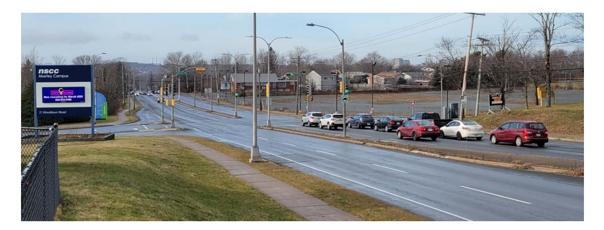
Main Street/Woodlawn Road/Caledonia Road Intersection looking northwest