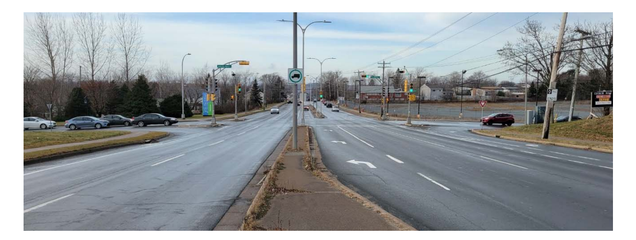
Main Street at Woodlawn Road/Caledonia Road looking west