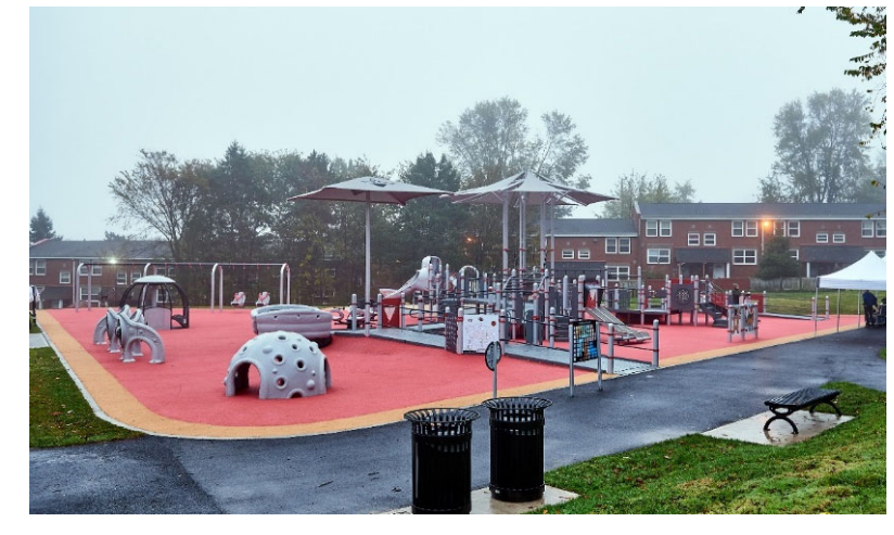
Image description: The JumpStart inclusive playground at the George Dixon Community Centre. The playground is fully accessible and is coloured grey and red. Accessible elements displayed include a ramp, swings, a We-Saw, We-Go-Around and rubber surfacing.

The playground at the George Dixon Community Centre was replaced with a new all-inclusive JumpStart playground.