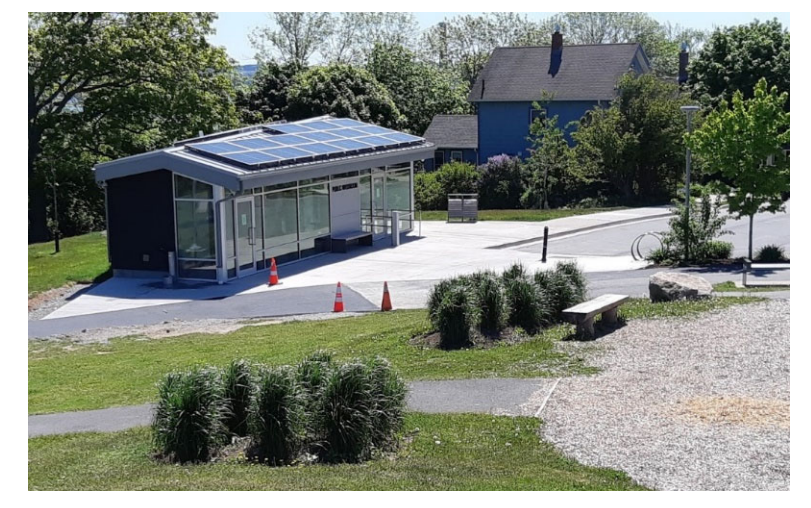
Image description: The newly constructed Fort Needham Memorial Park accessible washrooms. The building sits on a concrete barrier-free pad and has windows spanning the front side. Solar panels sit on the roof.

Accessible washrooms constructed in Fort Needham Memorial Park.