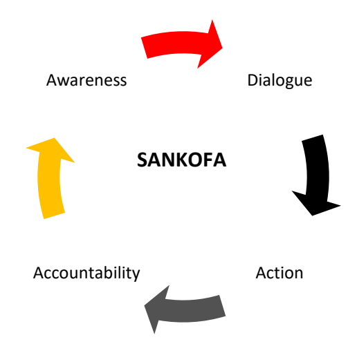
Figure 1. Essential elements of Sankofa

Sankofa provides a lens through which HRM can develop, implement and support the deliverables of the ABR Strategy and Action Plan by truthfully and reflectively looking inward and transforming from within to create possibilities for remedying long-standing disparities impacting people of African descent in the organization and the broader community. In this sense, Sankofa is a restorative, equity-aspiring principle. It will be understood and operationalized as an African-inspired principle to implant racial equity in policy, practice, and service delivery.