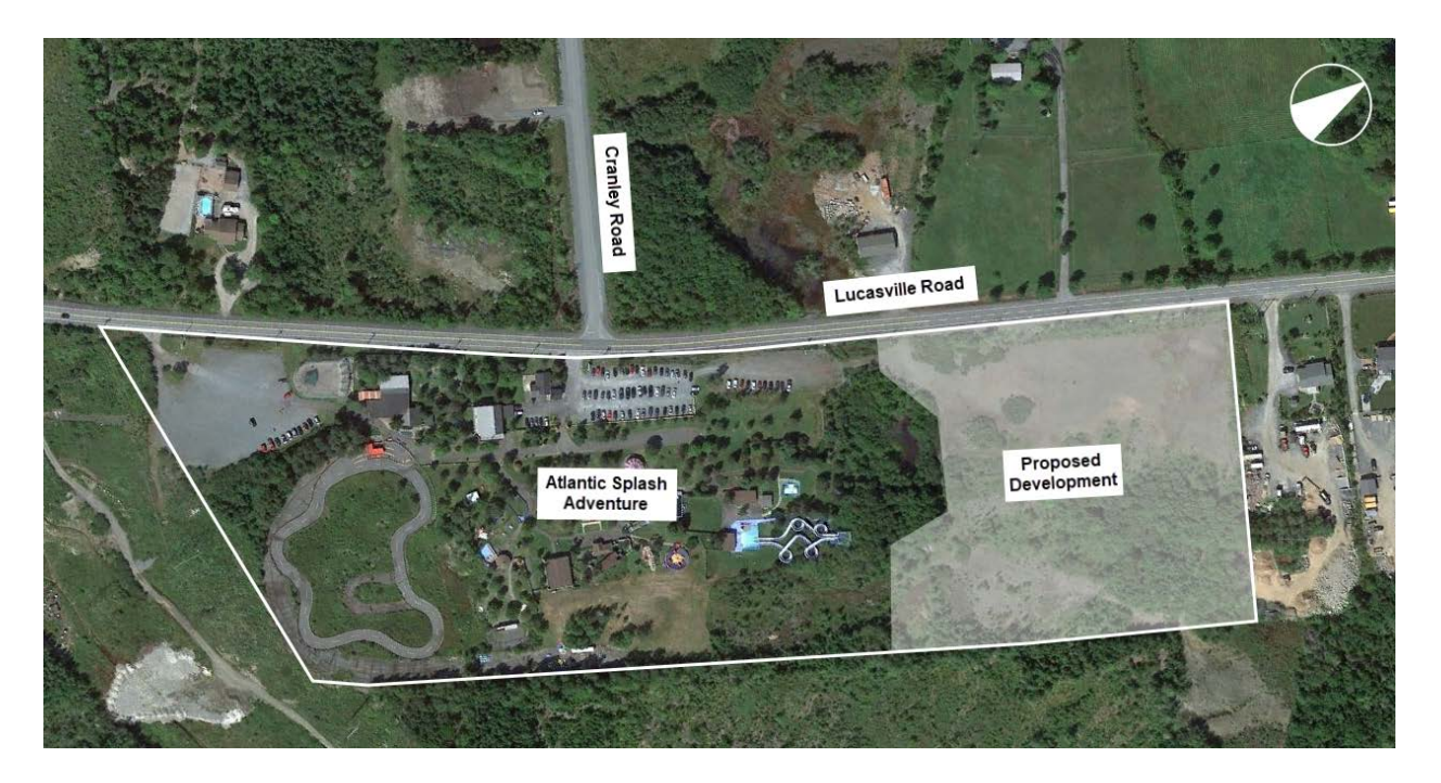
Figure 1: Site Context

The subject site is located on Lucasville Road northeast of Hammonds Plains Road. The site context is shown in Figure 1.