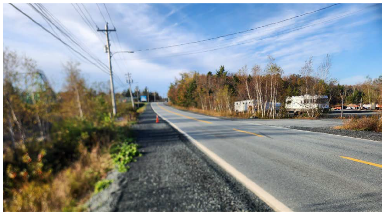
Figure 5: Sight Line Southwest of Access (Looking to the Left)