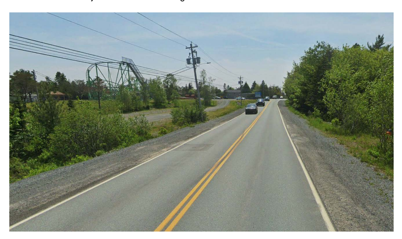
Figure 2: Lucasville Road

Lucasville Road is a major collector roadway that runs northeast-southwest from Sackville Drive to Hammonds Plains Road. Lucasville Road has a two-lane cross-section with one travel lane in each direction. Lucasville Road has a posted speed limit of 50 km/h. There is no transit service on Lucasville Road and there is no existing walking or cycling facilities. The Lucasville Road cross section near the subject site is shown in Figure 2.