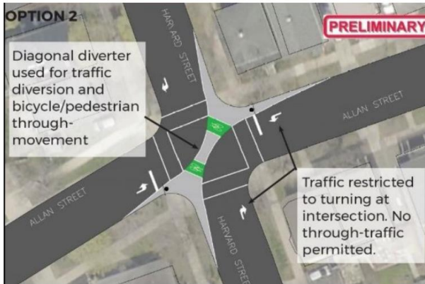
A Diagonal Diverter Planned for Allan and Harvard Streets (HRM)

The Allan-Oak Local Street Bikeway was approved by Halifax Regional Council in May 2018 as part of the Regional Cycling Network outlined in the Integrated Mobility Plan (IMP) . The vision is to provide safe, comfortable, convenient routes for people of all-ages-and-abilities (AAA) to cycle around the city. Allan and Oak will become quiet, traffic calmed residential streets to serve as an alternative east-west cycling corridor to busier streets like Quinpool and Chebucto.