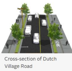
Cross-section of Dutch Village Road