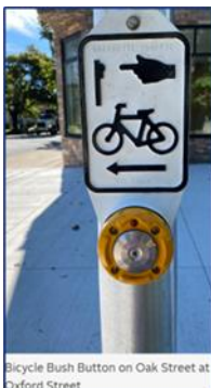
Bicycle Push Button on Oak Street at Oxford Street

The Allan-Oak Local Street Bikeway was approved by Halifax Regional Council in May 2018 as part of the Regional Cycling Network outlined in the Integrated Mobility Plan (IMP) . The vision is to provide safe, comfortable, convenient routes for people of all-ages-and-abilities (AAA) to cycle around the city. Allan and Oak will become quiet, traffic calmed residential streets to serve as an alternative east-west cycling corridor to busier streets like Quinpool and Chebucto.