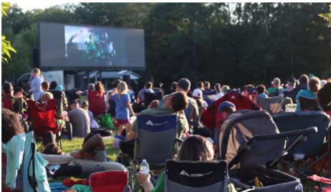
Great attendance at the Aug. 9 Summer Movie in the Kinsmen Park.