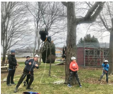
Hanging out with the Scouts

For more information on Halifax's solid waste program including updates on future depot events, please visit the website , download the Halifax Recycles app or call 311.