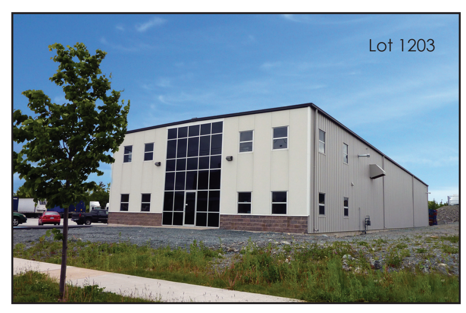
Hull Transport have moved into their new head office, warehouse & distribution facility at 107 Burbridge Avenue.

Elegant Flooring completed construction of their new 91,111 sq. ft. showroom / office and warehouse facility at 59 Wilkinson Avenue where they will carry out retail distribution of flooring product & installation services.