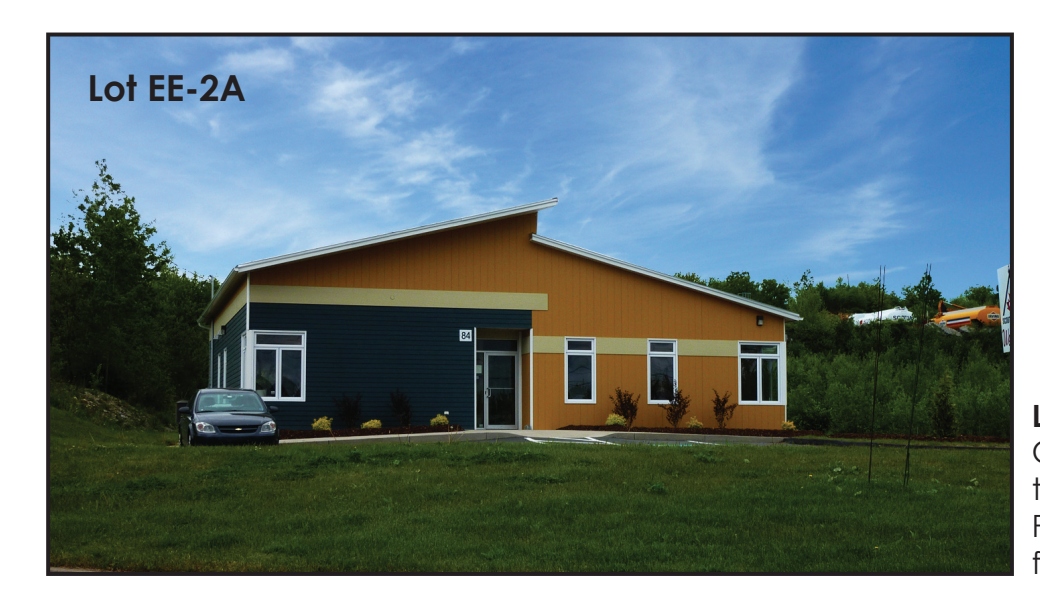
Lot EE-2A (Civic # 4) Thorne Avenue -Construction is now complete for the Boys Scouts of Canada, Provincial Council Society's new facility on this 22,809, sq. ft. lot.