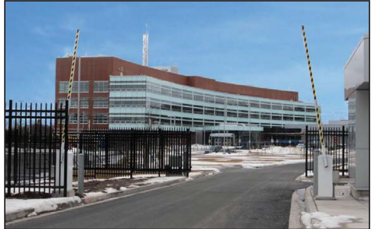
Construction is now complete at the new RCMP Head Quarters at 80 Garland Avenue.