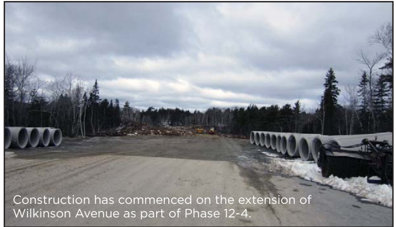
Construction has commenced on the extension of Wilkinson Avenue as part of Phase 12-4.