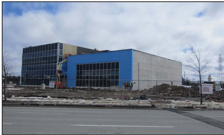
Progress is being made as construction continues for NSGEU at the corner of John Savage and Wright Avenue.