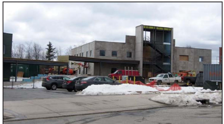
CSBT Holdings is making good progress with their office building on Garland Avenue.