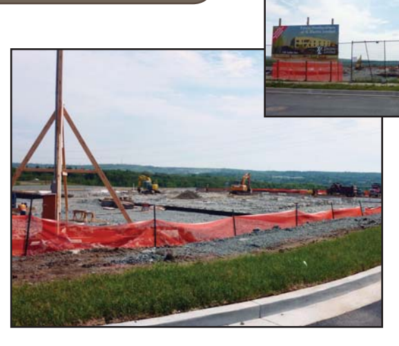
Construction is well on the way for Allied Land Corp. for their coffee distribution office and warehousing facility at 70 Thorne Avenue.

CNCA Holdings just purchased this 109,133 s.f. lot at 118 Cutler Avenue last quarter. This will be the future home of XL Electric.