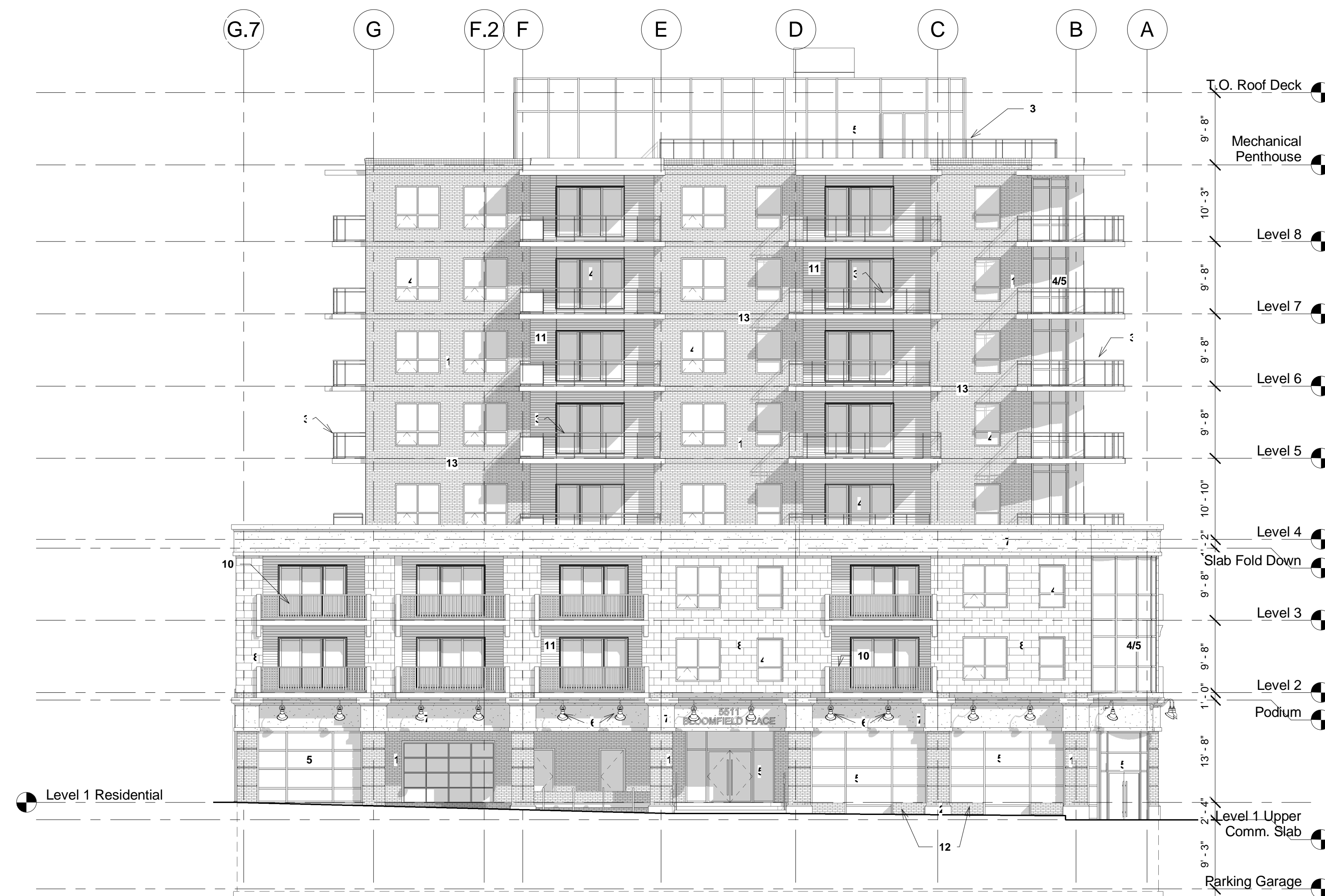
1 South Elevation DA 3/32" = 1'-0"