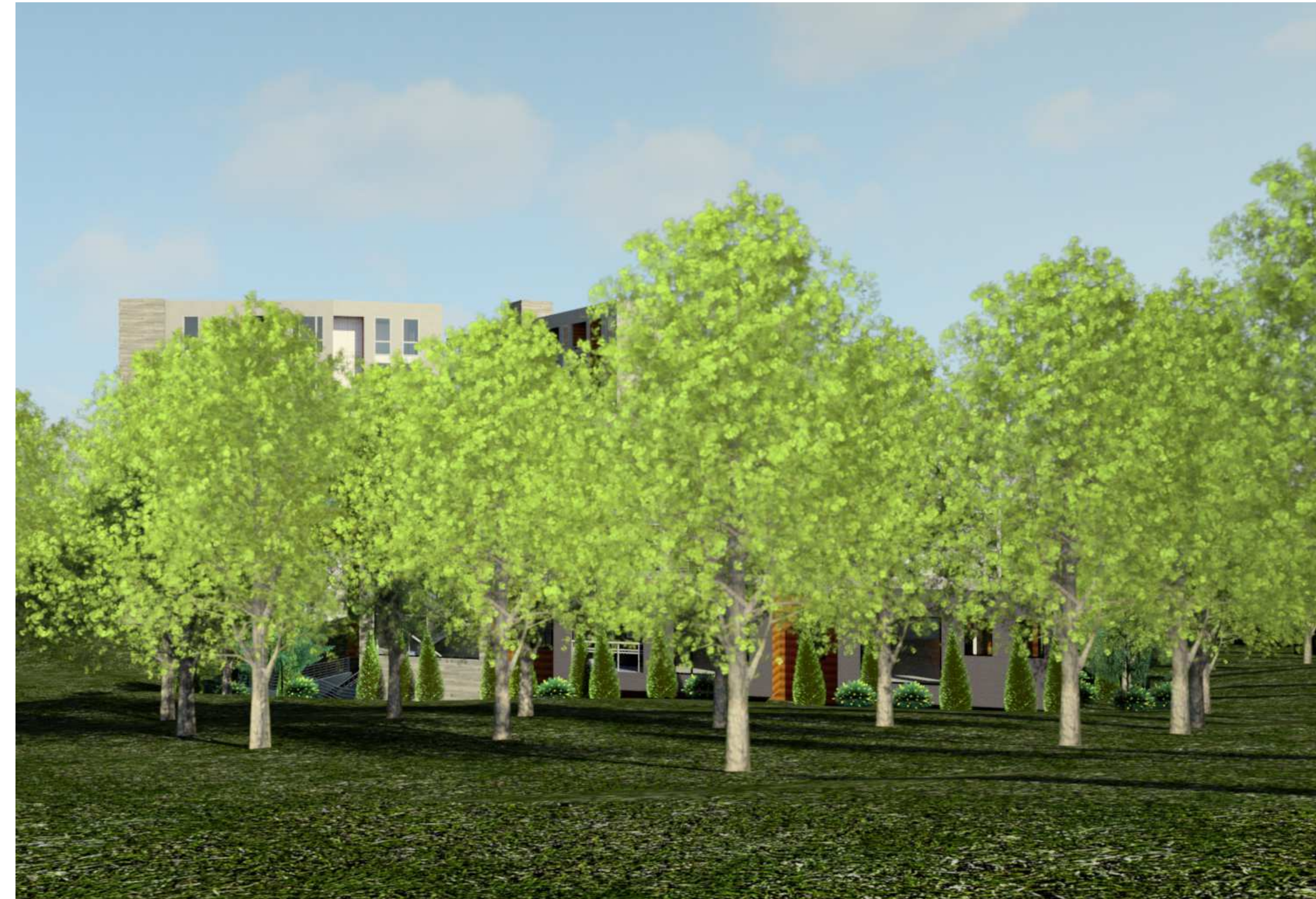
VIEW FROM RODNEY RD.