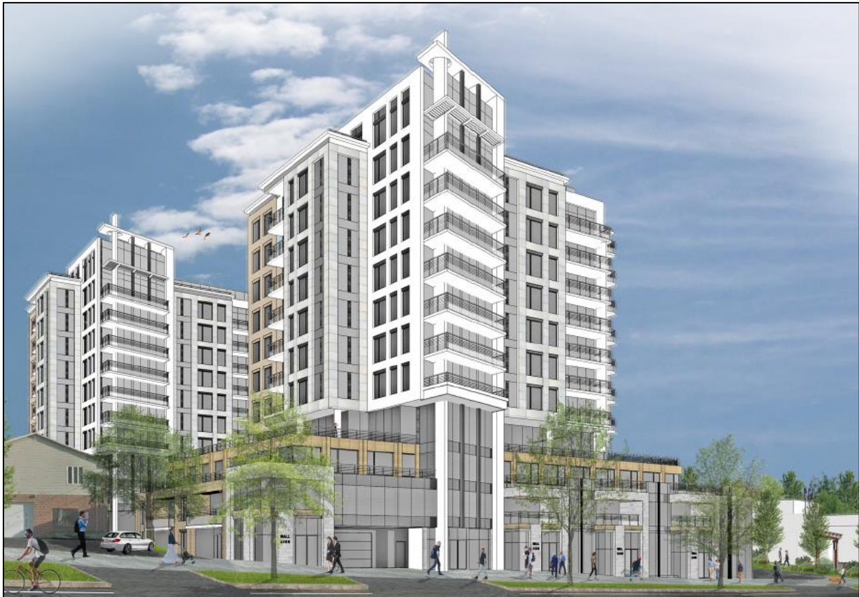
Figure 3 - Street Level View

The existing approval for a 12 storey, 84 unit building gives broad capability for a redesign of the siting and architecture of the tower, provided it does not exceed 84 units, through the non-substantive process. The first portion of this application is therefore to seek approval of a redesigned tower. The basic policy test for Council is whether the proposed changes improve the design. As outlined below, there are numerous benefits to the proposed redesign. To deal with the enlargement of the site to enable a second tower as proposed, substantive amendments are also needed. Both processes can be undertaken concurrently.