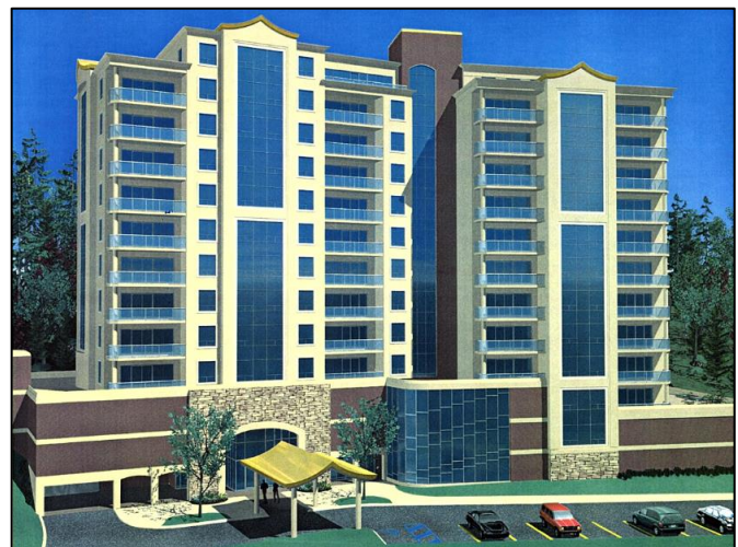
Figure 1- Approved Building

In 2006, Twin Lakes received approval from Harbour East Community Council for a development agreement for a 12 storey, 84 unit residential building on a site located on Prince Albert Road within the Grahams Corner area of Dartmouth. As part of the project, HRM conveyed two parcels of land to Twin Lakes including the former Bartlin Road right of way which had been closed as a street. This created a total site area of 2.27 acres. The development agreement received a time extension from Harbour East-Marine Drive Community Council in 2018.