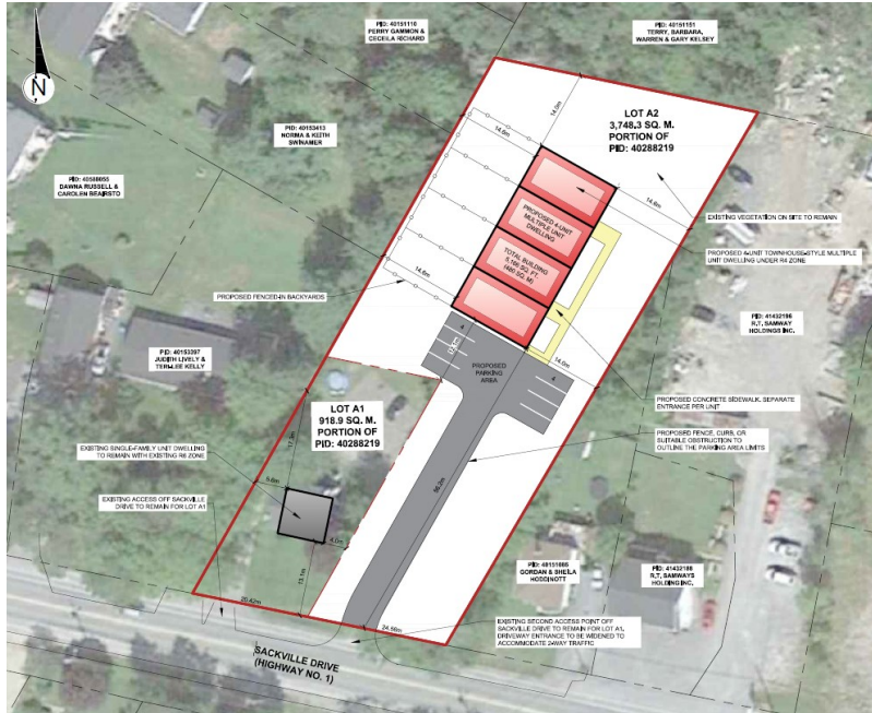
Figure 1: Proposed conceptual site plan for 1633 Sackville Drive

proposed conceptual site plan for 1633 Sackville Drive. For a more detailed image, see Attached A of this application submission.