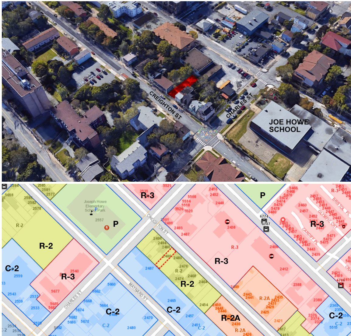
Figure 2: (top) The subject property, highlighted in red, is surrounded by a wide range of uses, including single family, multi-family, institutional, light industrial and commercial uses; (bottom) The subject property is situated within a small R-2 portion of a larger block zoned C-2 and R-2A. Properties across the street are zoned for high-density residential uses (R-3).

development as-of-right with no setback from the subject property. For example, the permitted GFAR permitted on site could be as high as 5, based on 100% coverage and current 50-foot high maximum. Permitted GFARs on much of Gottingen Street are also 5 or more. In the immediate R-2 zoned area, GFARs range as high as 2, some of which have been recently achieved through the standard variance process. In this regard, permitting a GFAR of approximately 1.2, with a site coverage of 60% or less will result in a building that fits well within the existing fabric of the neighbourhood and contribute to the area as a walkable, urban neighbourhood.