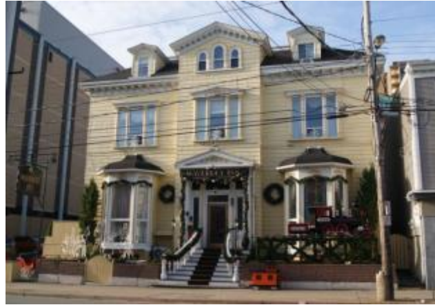
Late Victorian Period (1885-1900)