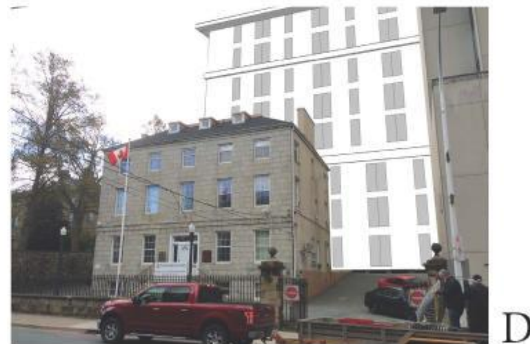
28 meter building within block