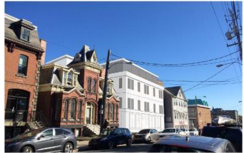
11 meter street wall with 14 meter building