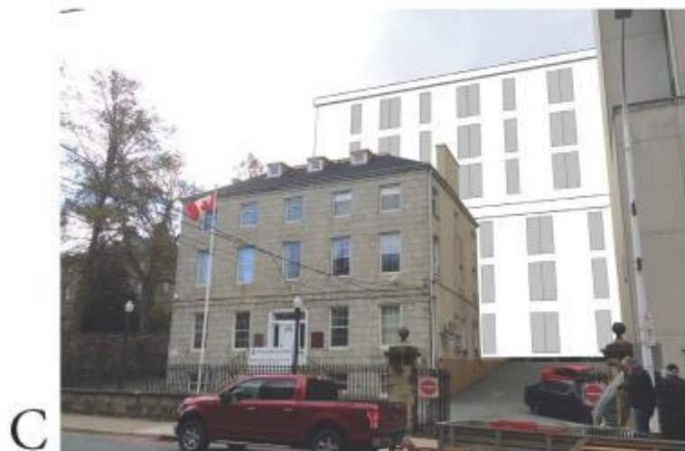
22 meter building within block - Recommended