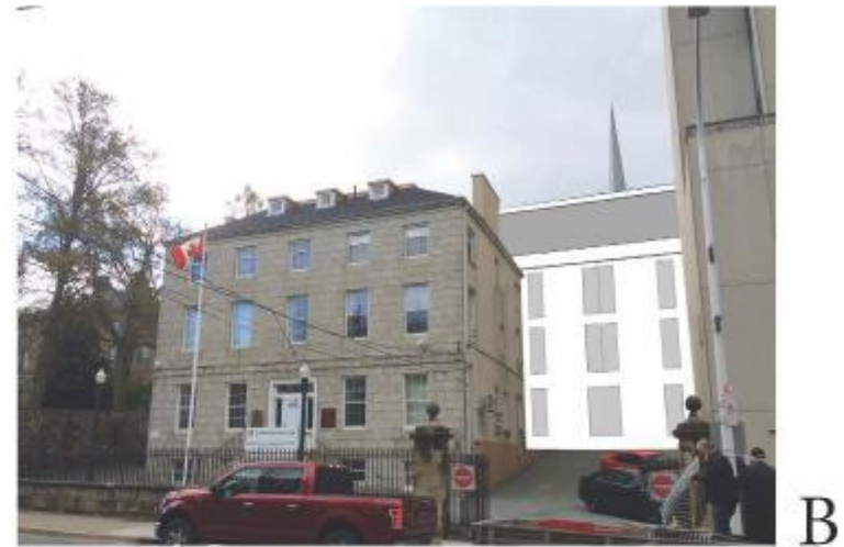
14 meter building within block