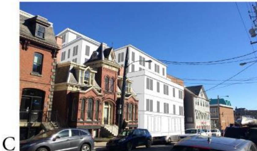
11 meter street wall with 22 meter building