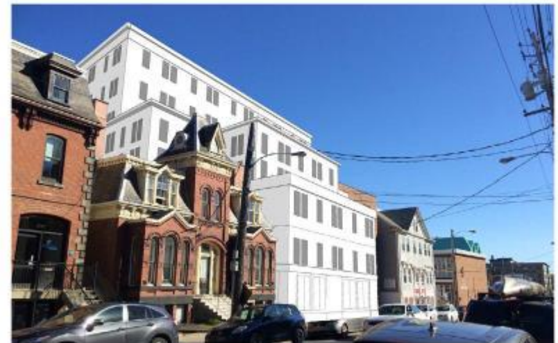
11 meter street wall with 28 meter building