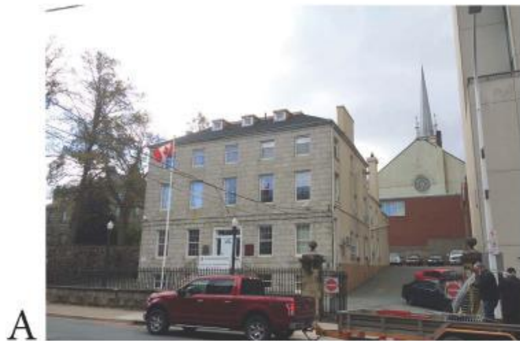
Existing street view with no development