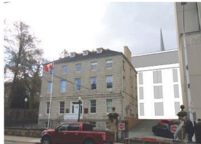
B 14 meter building within block