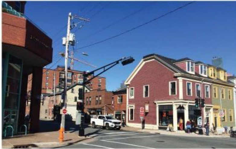
A Existing street view with no development