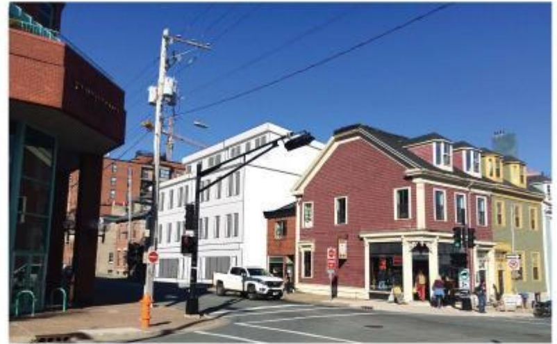
B 11 meter street wall with 14 meter building