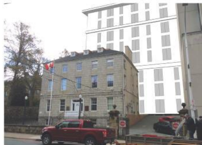
D 28 meter building within block