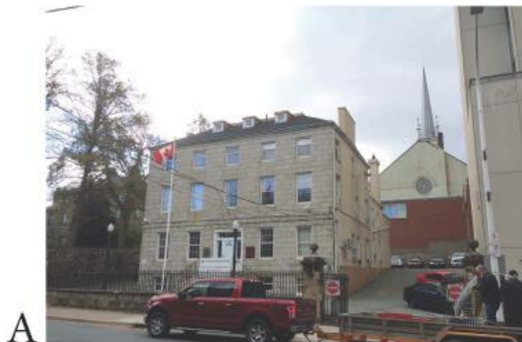
A Existing street view with no development