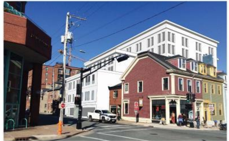
D 11 meter street wall with 28 meter building