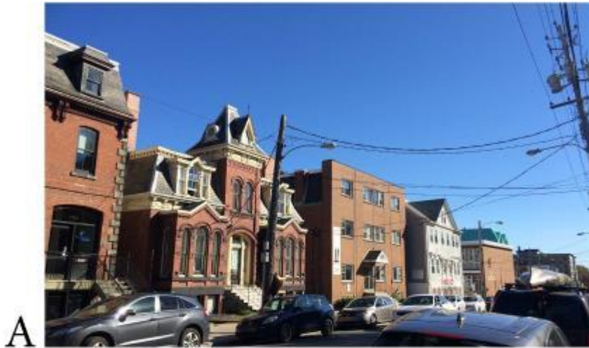
A Existing street view with no development