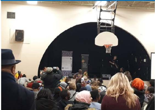
Photo from the 2019 AHM Opening Night Ceremony at the George Dixon Community Centre.

This year's provincial theme is Our History is Your History , which recognizes the unique story of African Nova Scotians and how this story is interwoven throughout the past, present and future of all Nova Scotians.