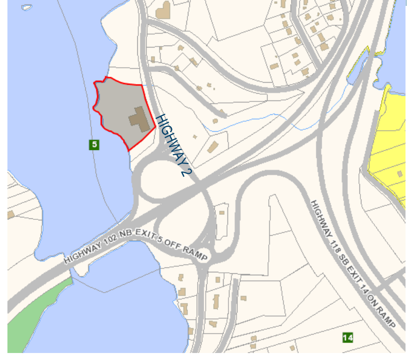
Site Boundaries in Red