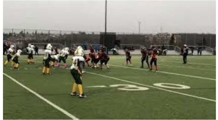
Timberlea Titans Minor Football

Exciting news! The municipality is developing a Playing Field Strategy to guide the planning and development of playing fields over the next 15 years to meet community needs across the region. The strategy will include an examination of: