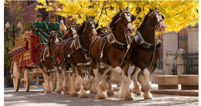
Halifax County Exhibition Aug 16 – 19

The Halifax County Exhibition will be held August 16 th to 19 th with the 2023 Exhibition theme being: "Rooted in Agriculture" .