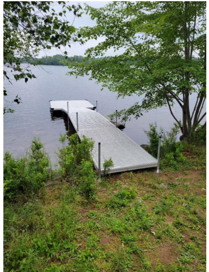
Raena June Perry Memorial Park Dock, Fall River

This was a joint project with HRM Parks and District 1 Capital Funds. Please enjoy safely!