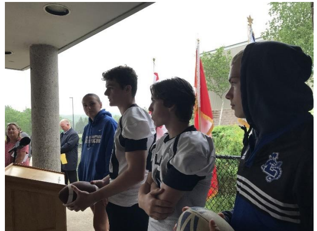
Student athletes of Lockview High School.

Project Committee members with elected officials at the funding announcement, Lockview High School.