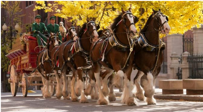
Halifax County Exhibition Aug 16 - 19

The Halifax County Exhibition is a family exhibition proudly run by the community and many dedicated volunteers since 1884.