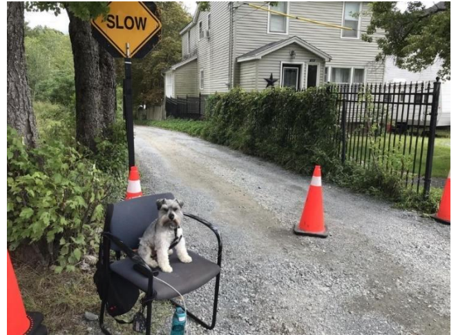
Charlie on gate duty for Keloose Festival.