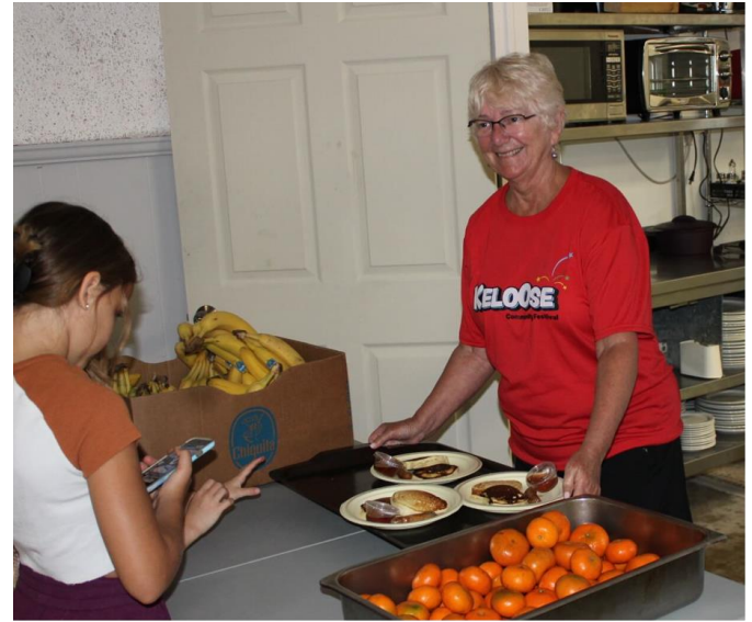
Keloose Fun Run