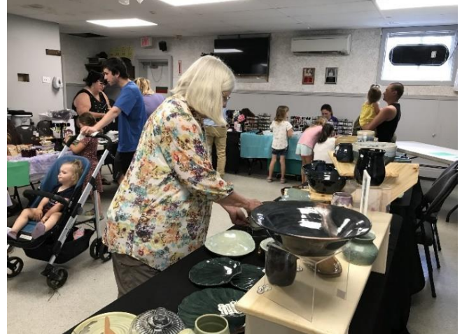
Amazing items available at the Keloose market.