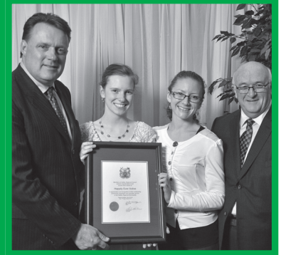
Happily Ever Active