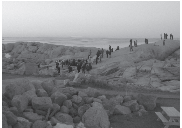
Easter Sunrise Service at Peggy's Cove