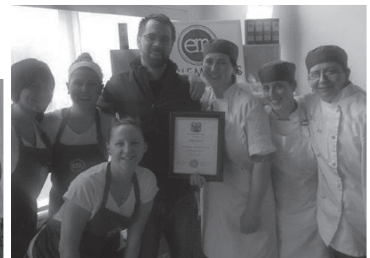
Acadian Fish & Chips and Edible Matters receiving certificates of recognition.